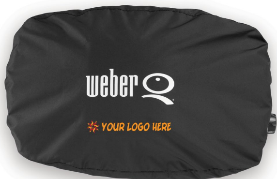
Bonnet Cover Q® 1000 Series with Heat Transfer Logo