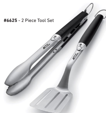
#6625 - 2 Piece Tool Set