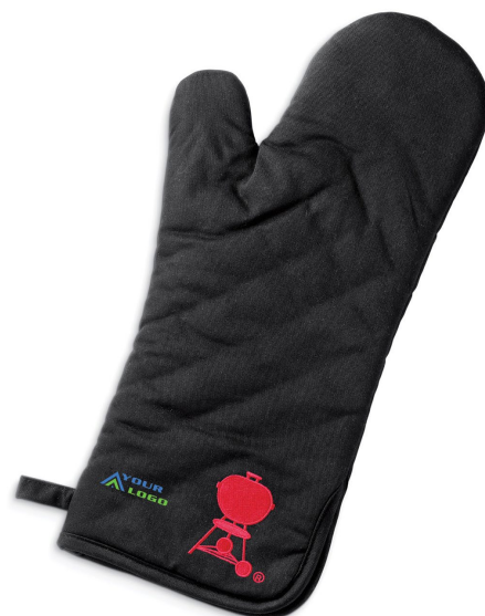
BBQ Mitt #6532