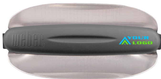
Handle B Jumbo Joe®