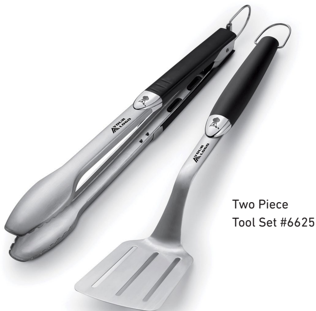
Two Piece Tool Set #6625