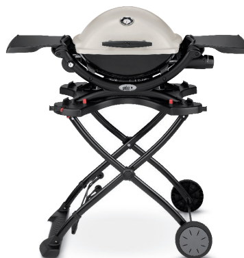
Q® Portable Cart