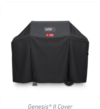
Genesis® II Cover

The heat transfer process involves printing an image on a transfer paper that is then applied to the item via a safe amount of heat and pressure over a short amount of time. The paper is then removed and the image is transferred to the item.