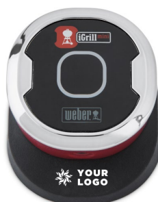
#7202 - iGrill Mini

setup fees apply | decoration cost identified is per imprint