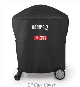
Q® Cart Cover