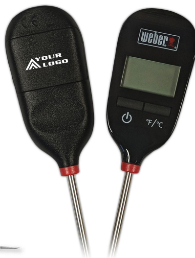
Instant Read Thermometer #6750