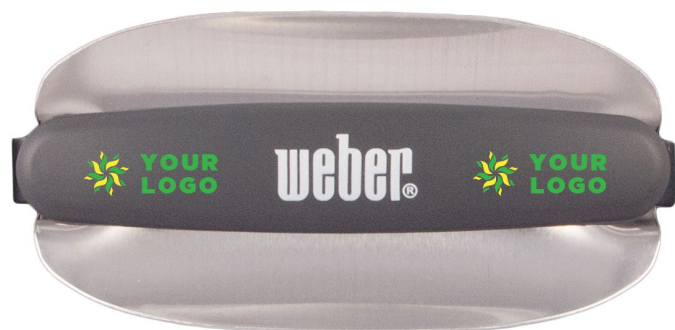
Handle D Original Kettle™ (Top), Performer® Recommended Customization is Two Imprints