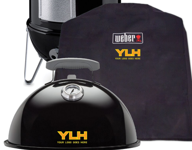
Smokey Mountain Cooker Organic Decal Custom Lid