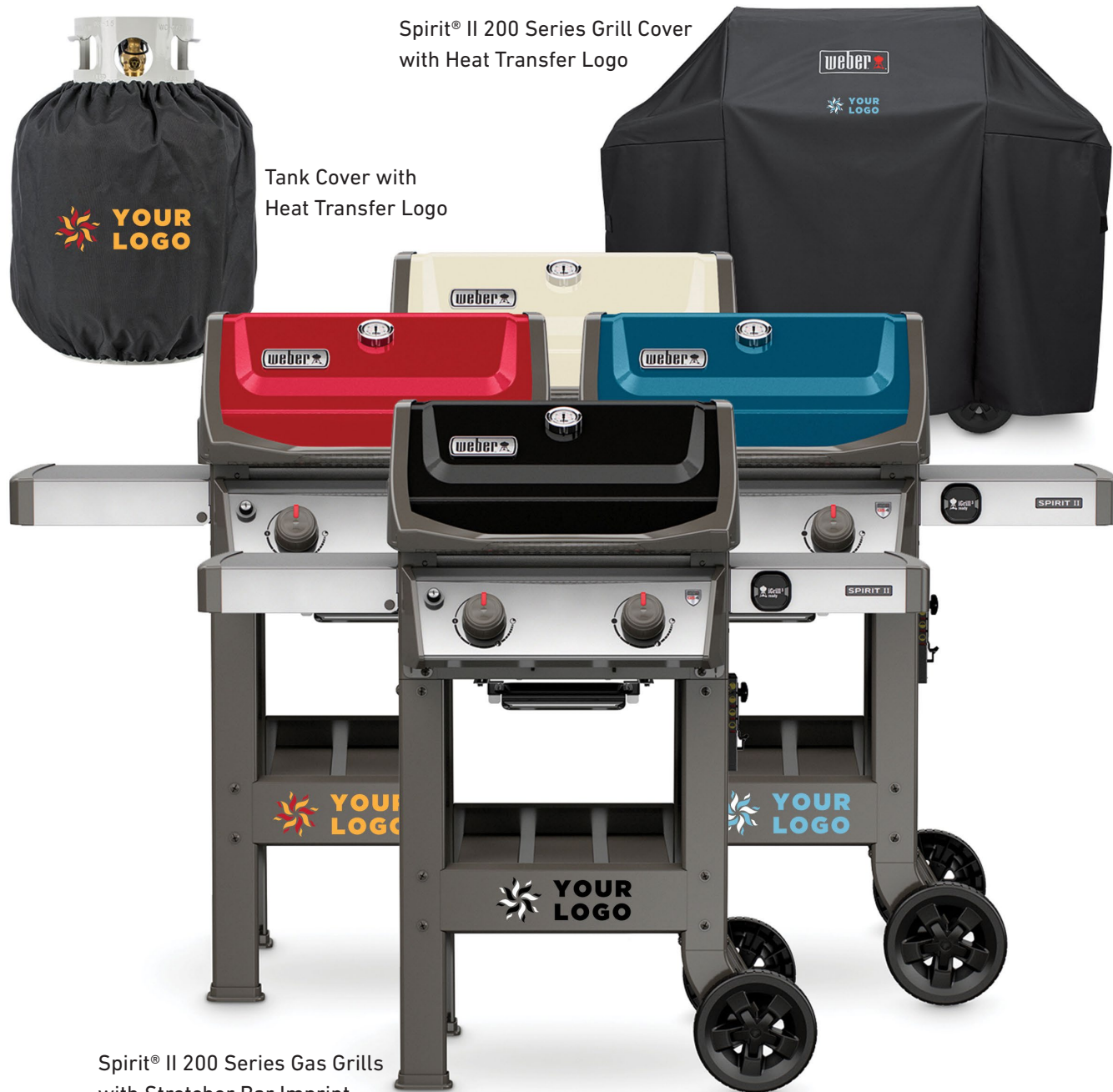
Spirit® II 200 Series Grill Cover with Heat Transfer Logo