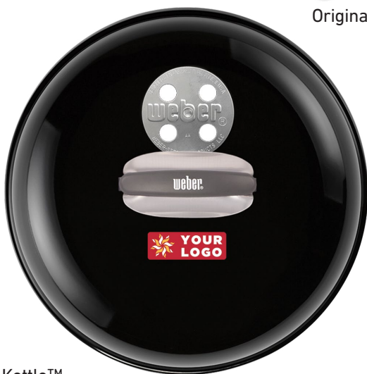
Original Kettle™ Organic Low Temp Decal Custom Lid