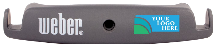
Handle E Original Kettle® Premium (Side)