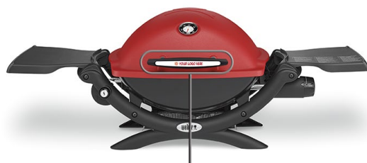
#51040001 - Q® 1200™ Gas Grill - Red

setup fees apply | decoration cost identified is per epoxy dome