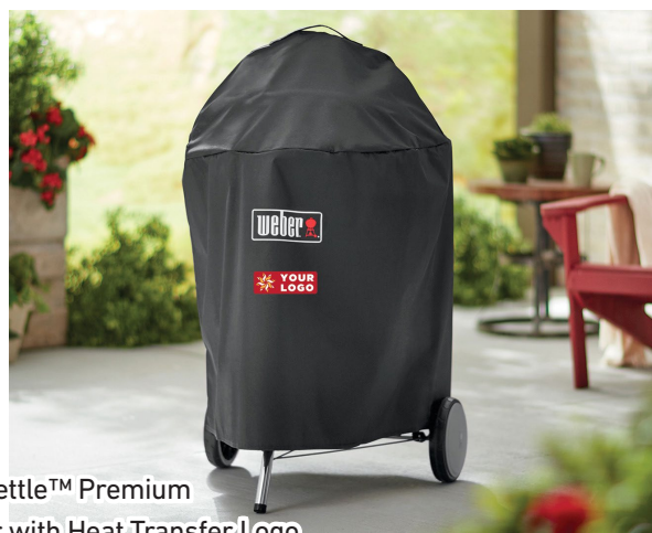
Original Kettle™ Premium Grill Cover with Heat Transfer Logo