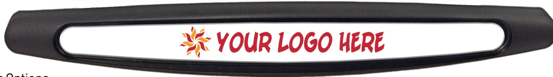
Q® 1200 Color Options