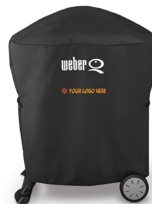
Q® Cover for Grill & Cart with Heat Transfer Logo