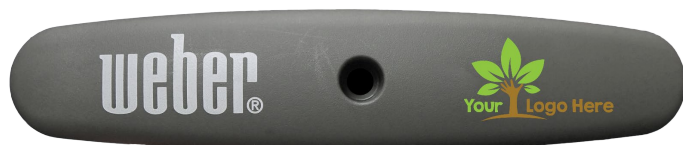
Handle C Original Kettle™ (Side), Go-Anywhere®, & Smokey Mountain Cooker™