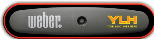
Smokey Mountain Cooker 14" Smoker