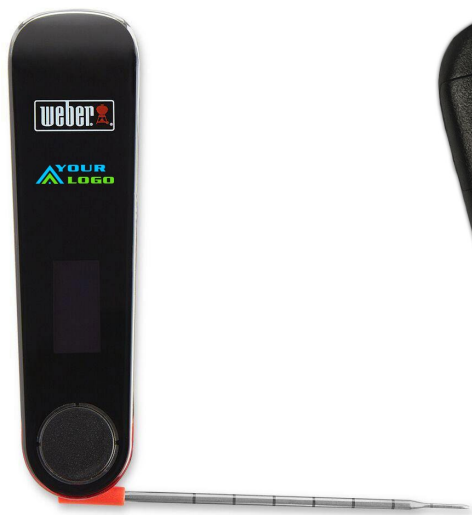
Snapcheck Thermometer #6753