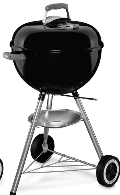
Original Kettle™ 22" Charcoal Grill