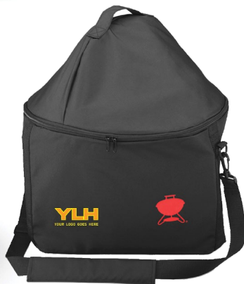
Smokey Joe® Carrying Bag with Heat Transfer Logo