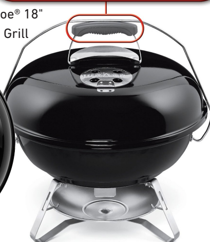
Jumbo Joe® Organic Decal Custom Lid