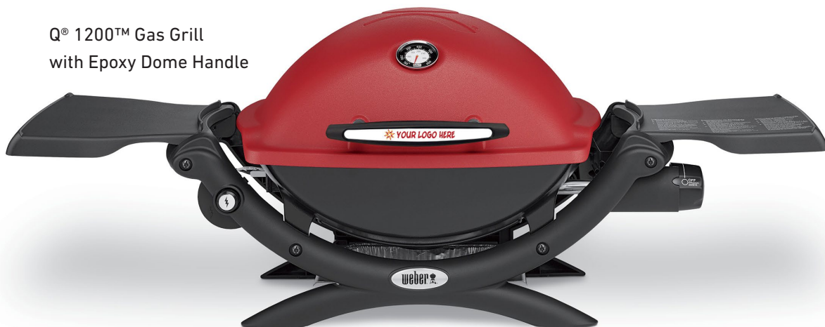
Q® 1200™ Gas Grill with Epoxy Dome Handle