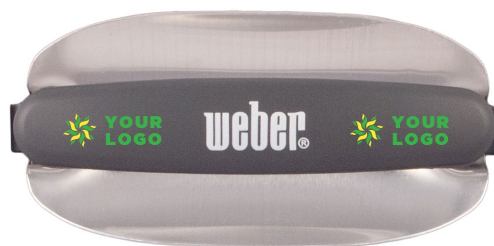
Original Kettle™ Top Handle

setup fees apply | decoration cost identified is per imprint